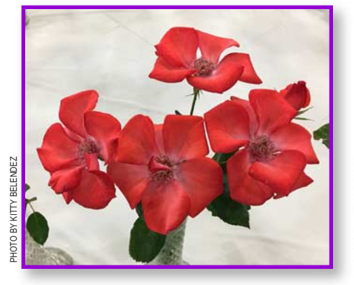
'Poppy' Miniflora Rose