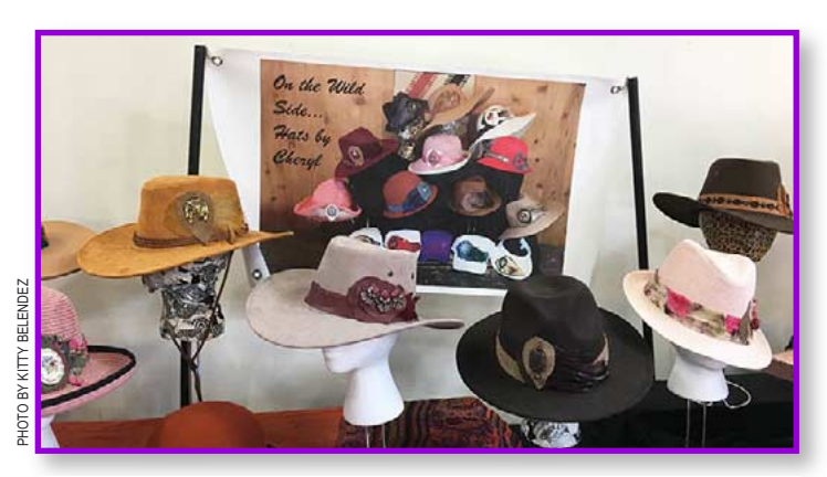
Hand Crafted Western Hats on Display and For Sale