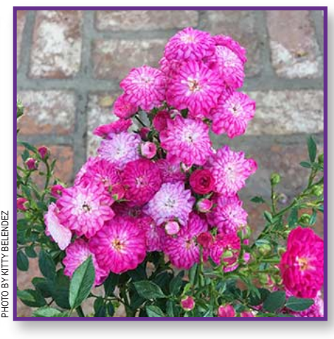
'Elfinglo' Micro-Mini Rose Big Clusters of Tiny Blooms, 1.5-ft