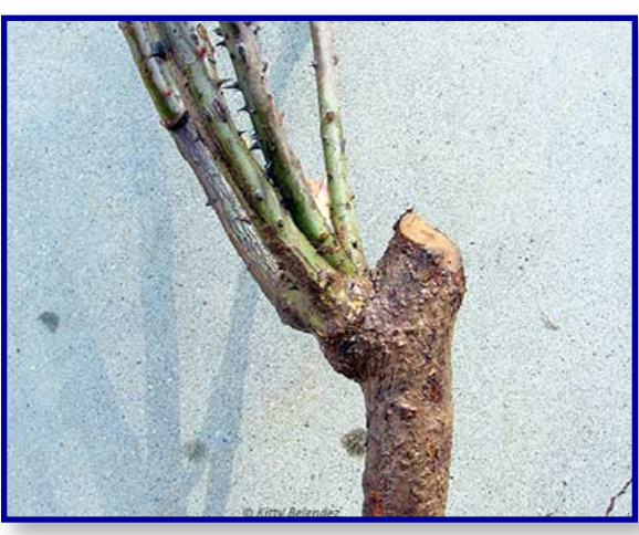
The top growth is the grafted bud union where the hybrid rose is grafted onto the rootstock.

For Santa Clarita locals I recommend either Green Thumb Nursery in Newhall, or Otto & Sons Nursery in Fillmore.