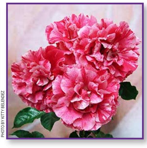
'Shadow Dancer' Climber Bloom Clusters Year-Round, 8-feet+ Very Tall