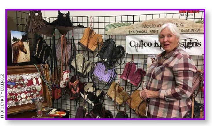
Hand-Crafted Purses Made Out of Boots