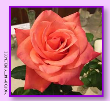
'Ring of Fire' Won by Vicki Wanek