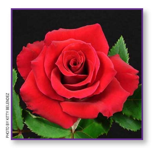
'Daddy Frank' Miniature Rose Prolific Blooms with Long Stems, 2-feet