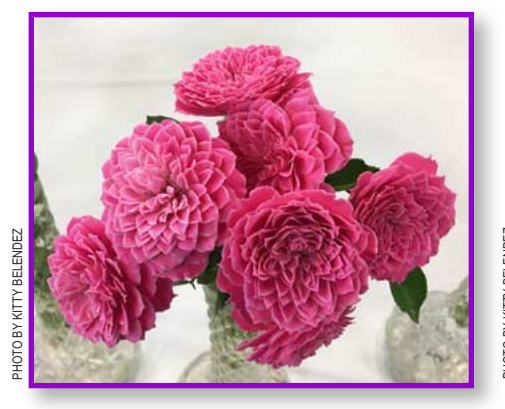
'Marriotta' Miniature Rose