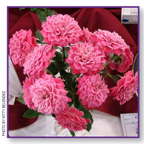
'Marriotta' Miniature Rose Prolific Clusters of Pink Blooms, 2-feet