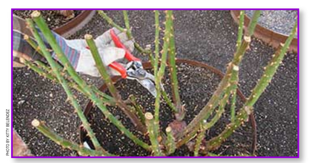
A Close-Up Look at Hand-Pruning a Hybrid Tea Rose Bush

Pruning roses can seem like a mystery, especially if you have never done it before. It's one thing to read about pruning in a book, but you have to actually get out there and see it being done, and then DO IT, to learn what pruning is all about.