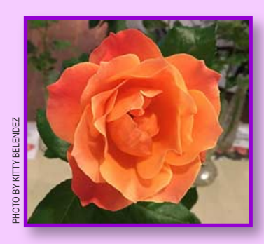
'Livin' Easy" Won by Vicki Wanek