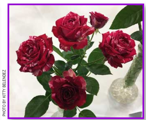
'Not Flash Night' Miniflora Rose