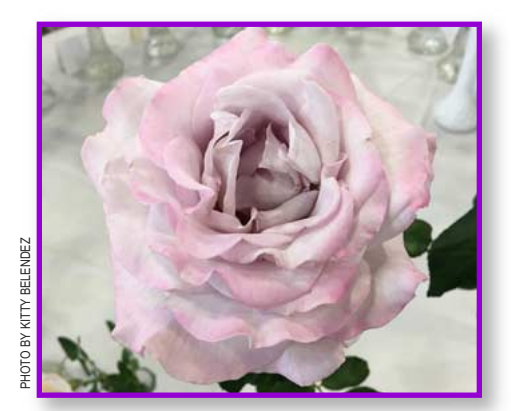
'Stainless Steel' Hybrid Tea Rose