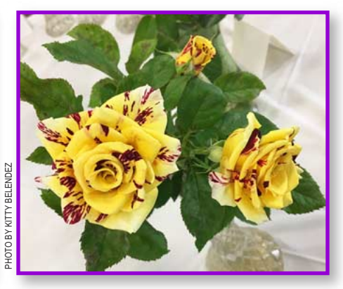
'Alakazam' Miniflora Rose