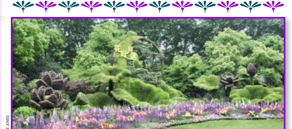
West Lake Garden in China