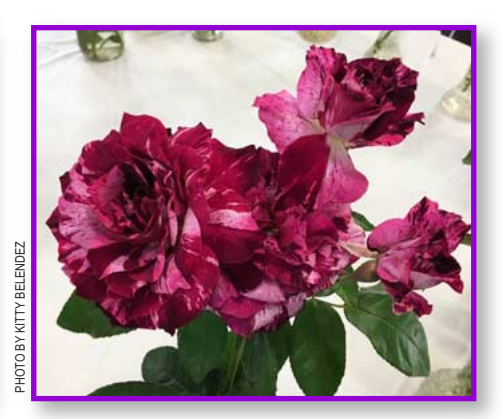
'Purple Tiger' Floribunda Rose