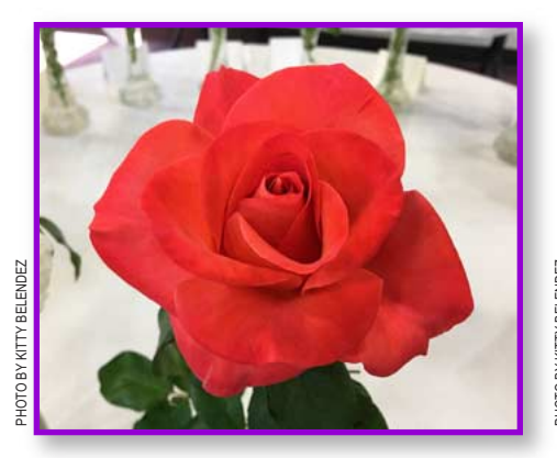
'Ring of Fire' Hybrid Tea Rose