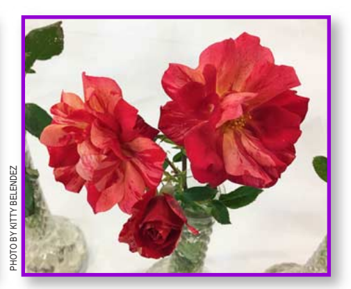
'Tattooed Daughter' Miniflora Rose