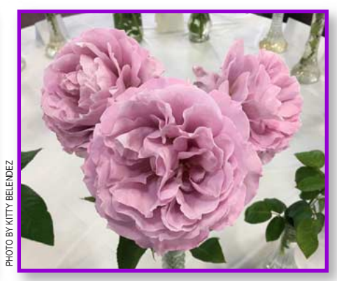
'Love Song' Floribunda Rose