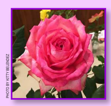
'Table Mountain' Won by Vicki Wanek