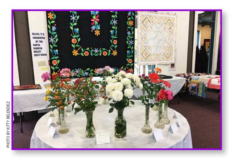
Bouquets of Roses and Hips on Display (white Fabulous! with its Hips)