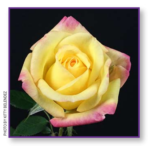
'Sweet Mallie' Miniature Rose Yellow Blend Blooms, 2-feet