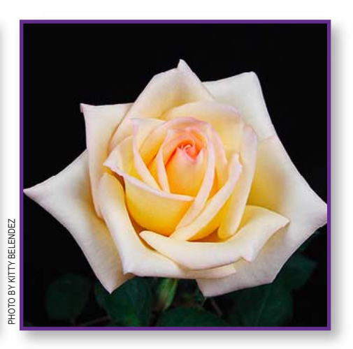
'Butter Cream' Miniflora Rose Yellow Blooms, 2-feet