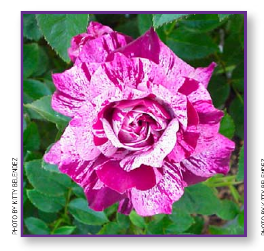
'Purple Tiger' Floribunda Rose Purple & White Striped Blooms, 3-feet

You can bid as many times as you want, in at least $1.00 increments. See Rafflemaster Beverley to write your name on the bid list.