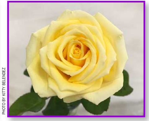
'Queen of Hope' Miniflora Rose