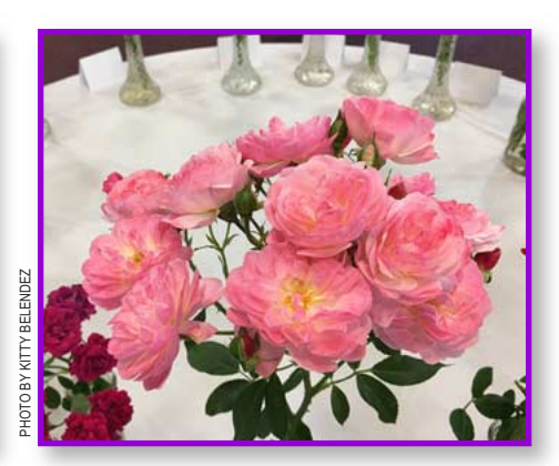
'Walferdange' Shrub Rose