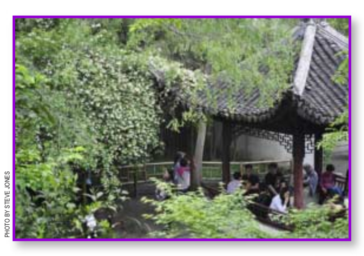
Rosa Banksiae in the Humble Administrator's Garden