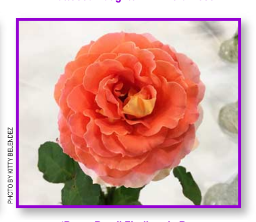
'Brass Band' Floribunda Rose