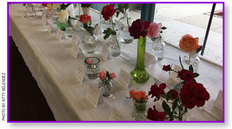
More Rose Specimens on Display