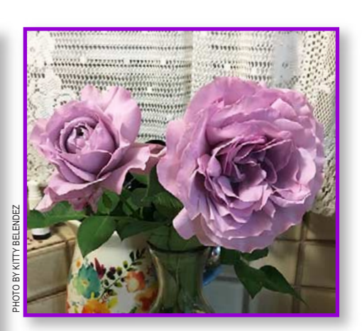
'Love Song' Floribunda