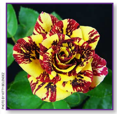
'Alakazam' Miniflora Rose Red & Yellow Striped Blooms, 3-feet