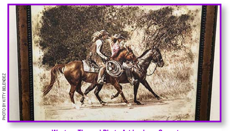
Western Themed Photo Art by Jerry Cowart