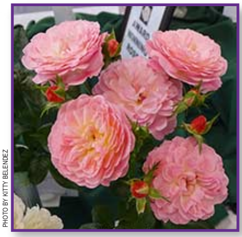
'Walferdange' Classic Shrub Rose Prolific Pink Bloom Clusters, 3-feet