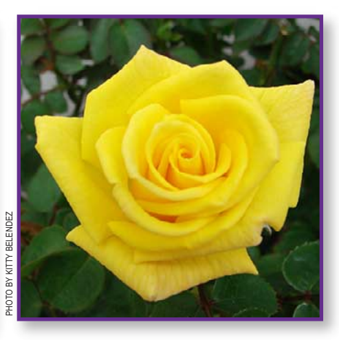
'The Lighthouse' Miniature Rose Bright Yellow, 2-feet